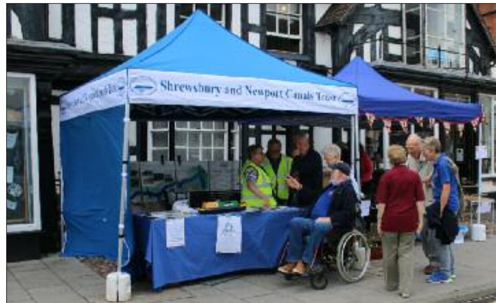
The new gazebo at Newport Carnival, outside Newport Guildhall

The trust has invested in a new gazebo – as the old one was starting to disintegrate, we really had little choice.