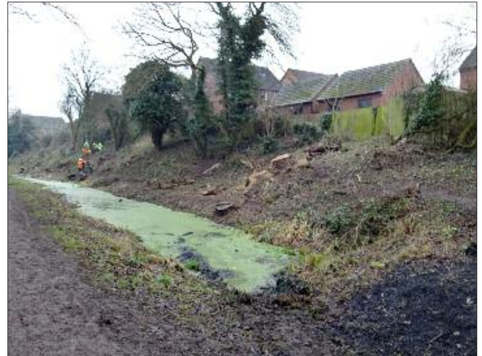
More tree removal at Lesley Owen Way. The line of the canal is clearly visible.

Eventually a blueprint document will be produced outlining all aspects of what the group aims to achieve and how it will get there, for agreement with the trustees. It will be a living document, meaning that it can evolve as restoration progresses and in the light of experience. The document will also contain summary information to help explain the plans to partners, funding suppliers, contractors, SNCT members, etc.