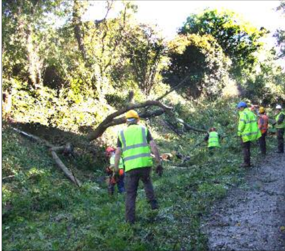
WRG and SNCT volunteers removing a tree at Sundorne, October 2016

Over the last few years the Shrewsbury Support Group has spent a lot of effort at their work parties clearing about 1.1 miles of canal at Sundorne, on the west side of Shrewsbury, between Telford Way and Pimley Bridge. In early 2016 they produced a document which looked at the possible re-watering of this stretch of canal. They concluded that it should be possible to re-water the stretch and proposed to the SNCT trustees that the group should work up the idea. The trustees agreed and the Shrewsbury Canal Re-watering Group (SCRG) was created as a part of the Shrewsbury Support Group.