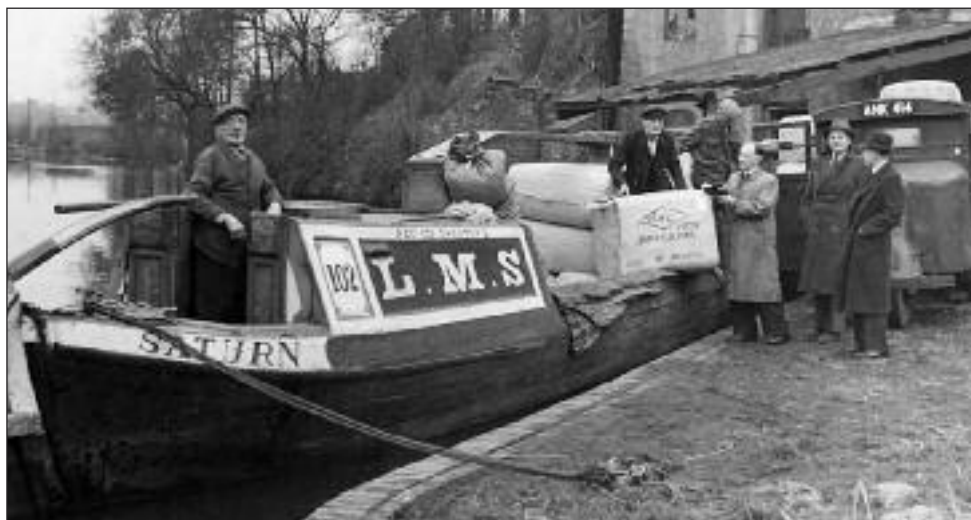
Kidderminster Carpet Museum

Saturn is the only surviving example of a horse-drawn Shropshire Union fly-boat in the world. She was built for the Shropshire Union Canal Carrying Company in 1906 at the company's dock – which still exists – at Tower Wharf, Chester and was registered on 15 January 1907. She was allocated Shropshire Union fleet number 598.