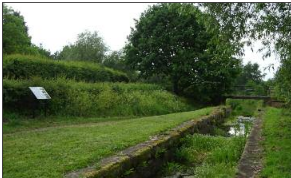
The new information board installed adjacent to Tickethouse Lock No. 21

Tickethouse Lock is the westernmost of the three locks that divide the 1½ mile length of canal which is in water at Newport. Like the others, it was filled in but is otherwise undamaged. However it does have a water main passing through it which will add to the challenges and cost of restoring it.