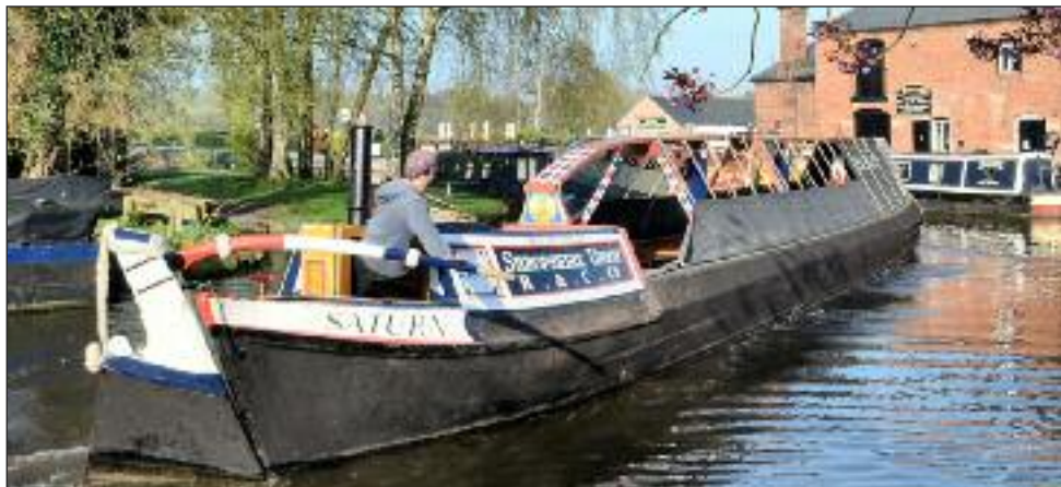
Saturn, towed by Dane, at Fradley Junction on the way to the 2017 Boat Gathering at the National Waterways Museum

Saturn was purchased for preservation by British Waterways in 2000 and came into joint-ownership with the Shropshire Union Fly-Boat Restoration Society (SUFBRS). Complete restoration was undertaken by Malkins Bank Canal Services and society volunteers – funded by the Heritage Lottery Fund, WREN (Landfill Tax), The Waterways Trust, the Shropshire Union Canal Society, The Manifold Trust, the Chester & District Branch of the Inland Waterways Association, the society and others. Complete ownership was recently transferred to SUFBRS by the Canal & River Trust (CRT).